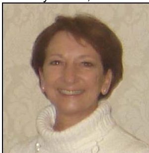
Fidelity National Collection Sales Manager Phone: (800) 445-2562

certification opportunities and recognize those who have achieved their goals.